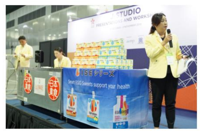
The largest egg company in Japan, Ise Foods showcase and presented to the crowd on their latest innovative egg beverage products.