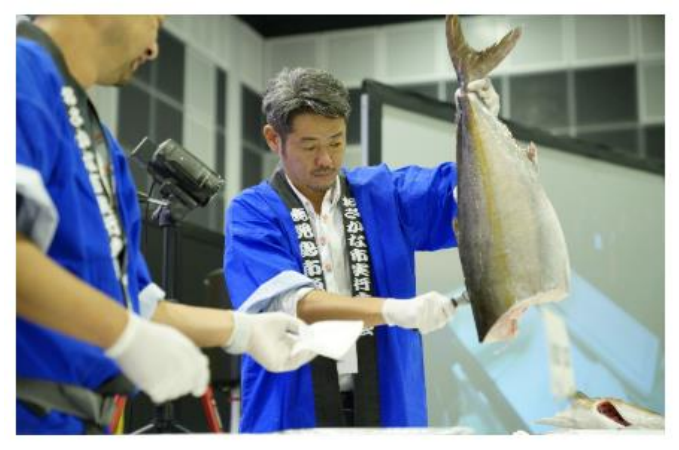
Kagoshima Fish Market took the stage to demonstrate their Special Fish Cutting Show of Amber jack fishes and the audience sample the delicious sashimi.