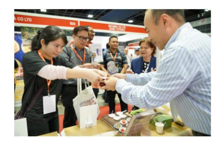
Visitors get up-close with the exhibitors to conduct business discussion and meetings the unique prefecture specialties from the 40 prefectures this year.