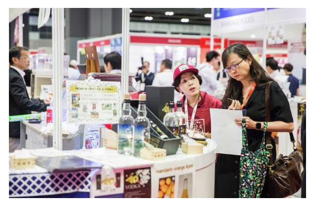
Platform for Southeast Asia key buyers from retail, wholesale, hospitality and food services to source Japanese prefecture specialties.

First ever showcase in Food Japan - Bluefin Tuna produced by a Kindai university fisheries laboratory.