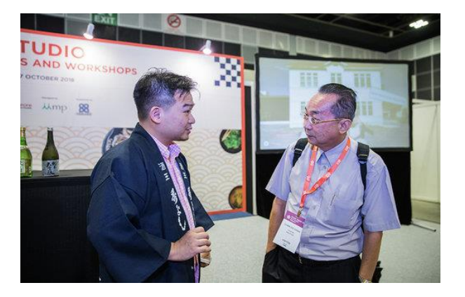
Visitors get up-close in an exclusive Masterclass with Sake Sommelier.