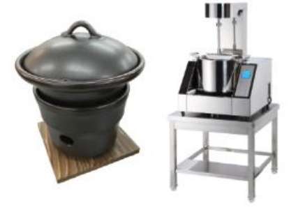
Mie Prefecture MINAMI SANGYO CO LTD (Booth A07)

Patented airflow pulverizing machine for grinding soybeans and its Banrai soymilk concept has been adopted by restaurants in more than 27 countries, including Michelin star-rated ones in New York and London.