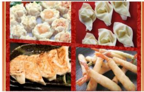
<u>Tokyo Prefecture</u> <u>NICHIMO CO LTD (Booth B22)</u>

Made in Japan automatic food processing machinery for all kinds of chinese and japanese noodles and pastry.